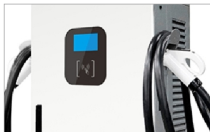
Charging Pile Etc