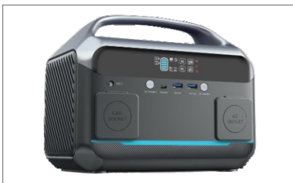
Outdoor Power supply