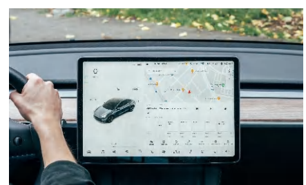
Cockpit central control display screen